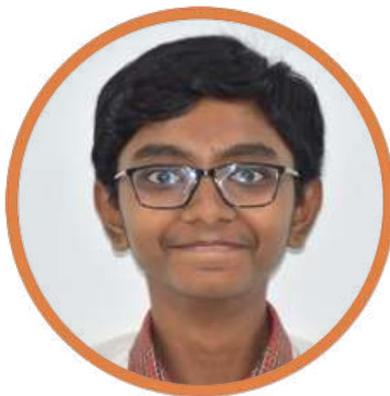
TOSHITH COMPUTER SCIENCE