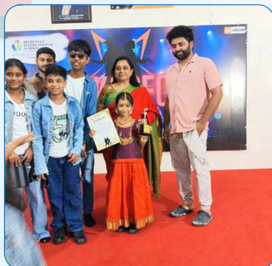
HIS Guindy Dazzles at Karapakkam Dance Fest