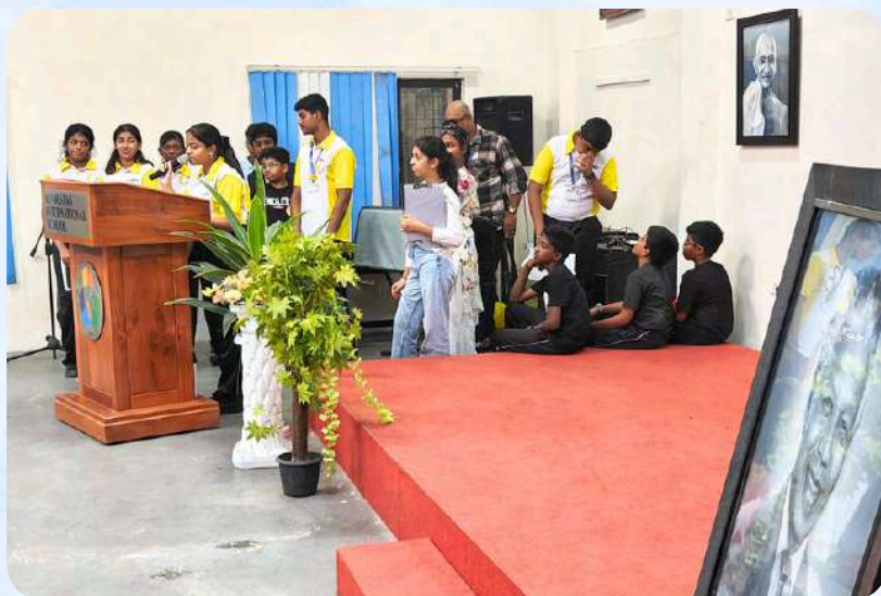
A TRIBUTE THROUGH PERFORMANCE

On July 18, 2025, Hindustan International School-Guindy commemorated the Nelson Mandela Day with a special assembly held in the Guindy Auditorium. The event, led by the Nelson Mandela House mentor and students, aimed to honour Mandela's life and inspire students from grades 5-12 to embody his values of peace, justice, equality, and service.