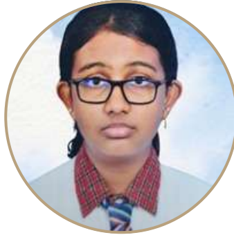
RIDA 5A* & 2A GRADES