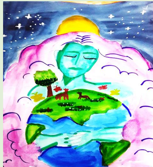
Akshetha – 7B