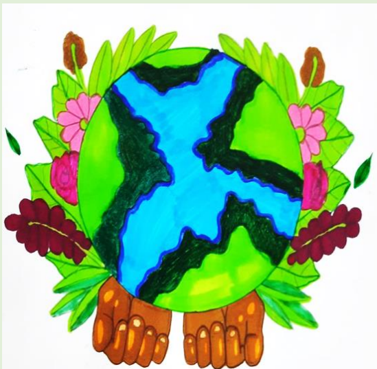
Akshitha – 6A