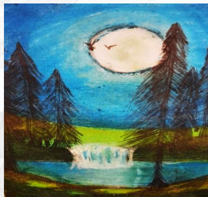
Devesh – 8B