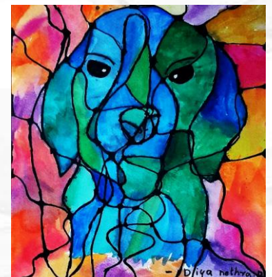
Diya Netra – 5B