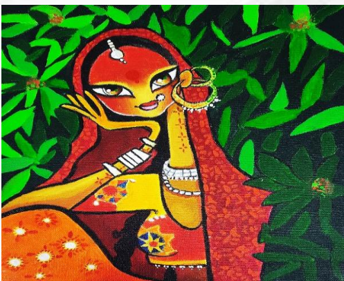
Pranav Sagar – 6B