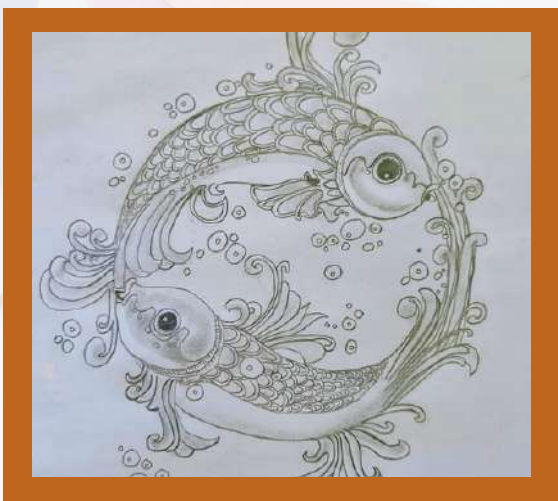
JAIWANTH - GRADE 8