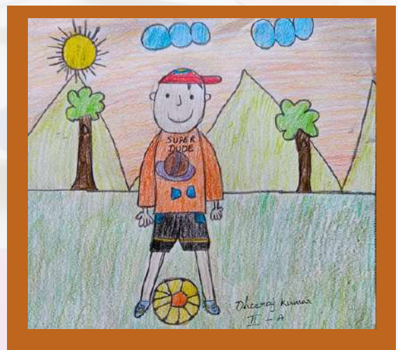
DHEERAJ - GRADE 3A