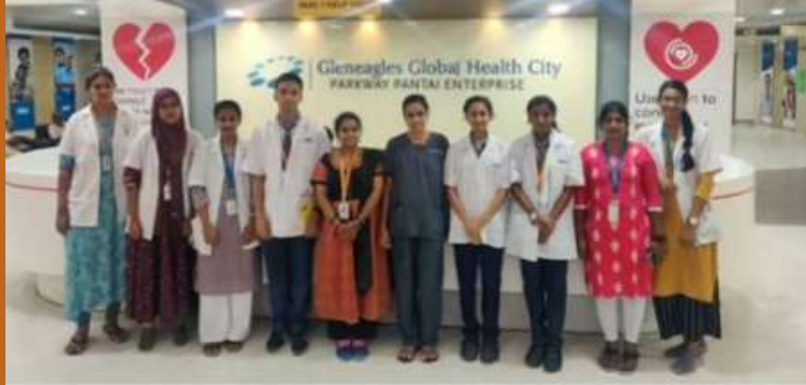
Dept. Nutrition & Dietetics