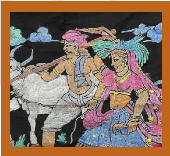
JOSHUA - GRADE 8