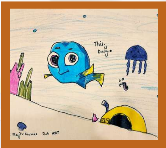
JOANNA - GRADE 3A