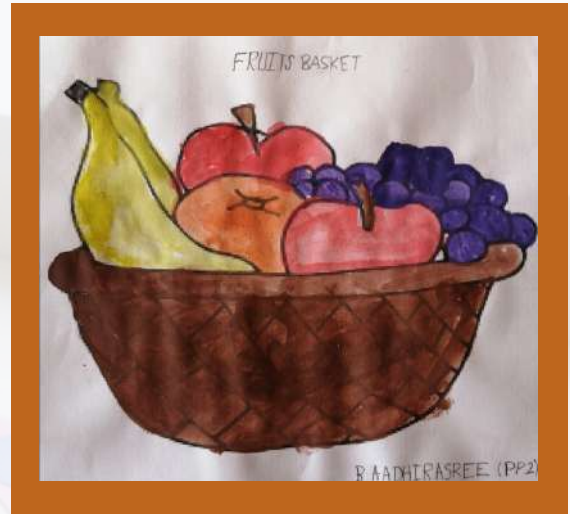
AADHIRASHREE - PP3