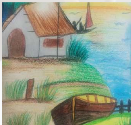
AADRIKA - 5A