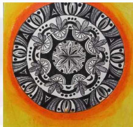
AKSHARA - 7A