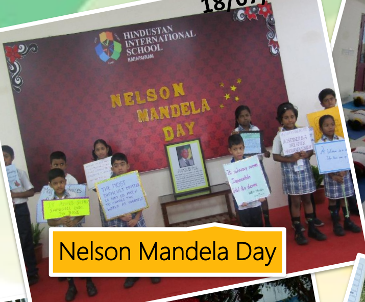
Nelson Mandela Day