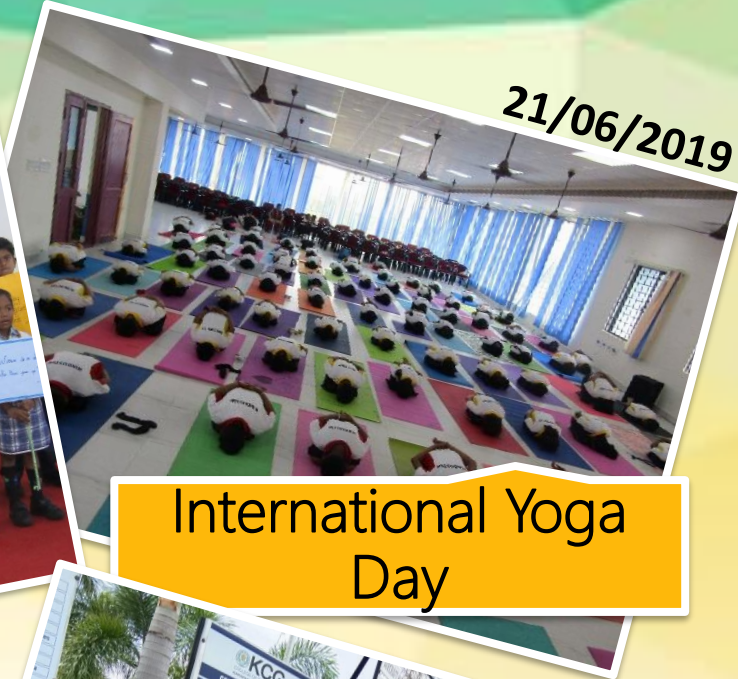
International Yoga Day