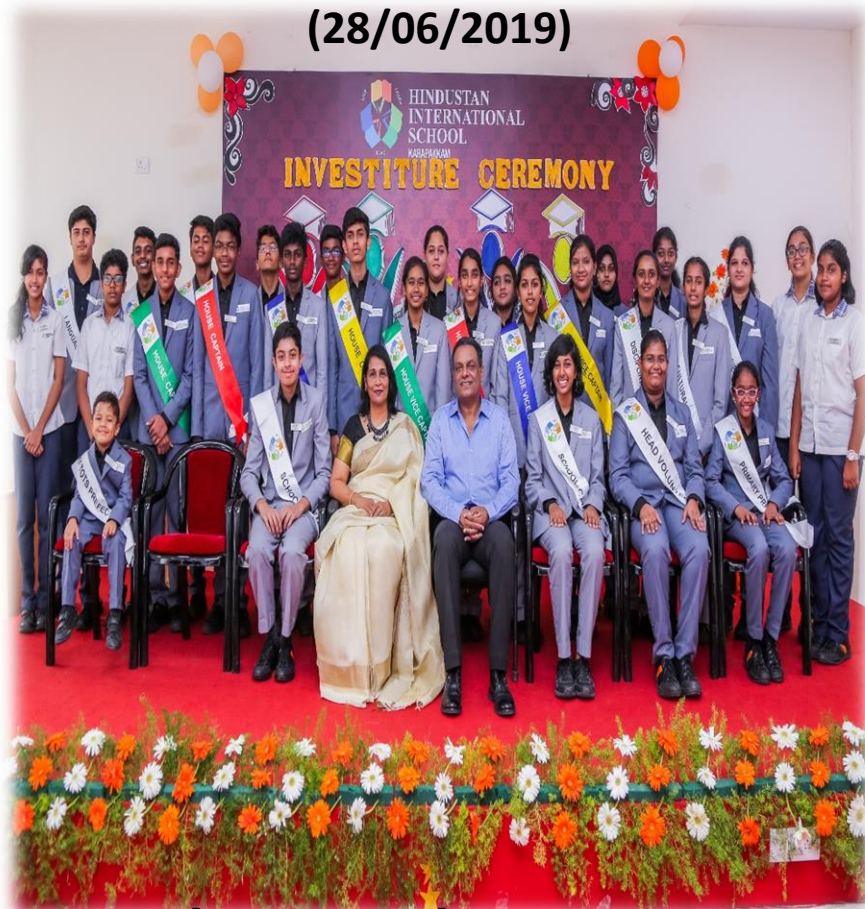
Student Council 2019-2020